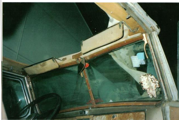
1936 Cabriolet Windshield Detail