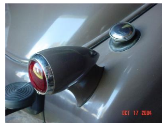
Late style round tail lamp.

A major difference between early and late production cars is found in the tail lamps. Early production cars were made with the 1935 oval (teardrop) shaped tail lamps. These were changed to round lamps later in the year. We have no idea exactly when this change was made. Another difference seems to be in the horn button. Early versions were plain black; later, Pontiac script was added to the center. Early cars often had crackle green 1934-35 heaters; later cars brown Model 52 heaters. Early mirror watches were round; later versions were square. There were probably other small differences we have not yet noticed.